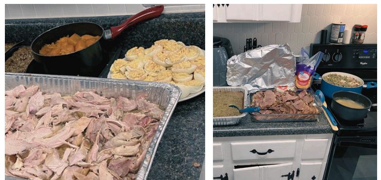
(Above) Oxford House Grata in Nashville opened its doors to celebrate Thanksgiving with their Oxford Family.